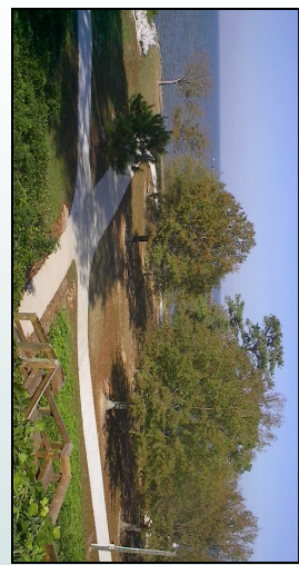
South Beach Park Loop Trail

22 Barnwell Field is a City-operated park on Hwy. 98 in Barnwell. The home of Fairhope Youth Football, it has two youth football fields, two baseball / softball fields and shaded pavilions.