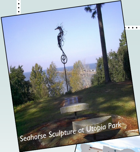
Seahorse Sculpture at Utopia Park